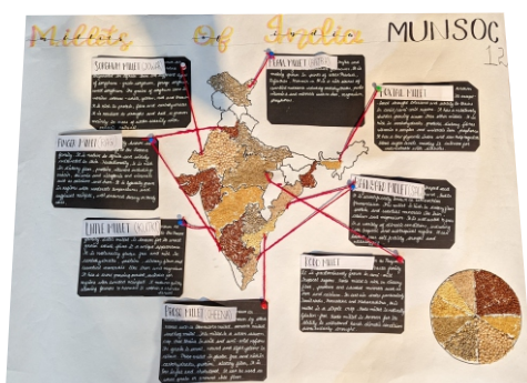
Ain Alsaba II PCMB - D

In order to create awareness among its students, Christ Junior College has decided to make 'Millets' the theme of the academic year 2023-2024. To celebrate this, the CJC MUNSOC team conducted an interclass poster making competition - 'India Millet Map', for all the II PUC classes. The participants had been instructed to use only sustainable and eco friendly materials, and to avoid using plastic and thermocol. This competition encouraged students to look at the future through millets, to ponder upon the fact that a green, healthy and happy future depended on the small choices we make. The classes II PCMB - F, II PCMC - H, II HESP - M and II PCMC - I placed. They were ingenious in their approach and captured the true essence of the theme. After the competition, all the posters were displayed in the college quadrangle. Not only did the students come up with a myriad of ideas, but their execution was flawless as well.